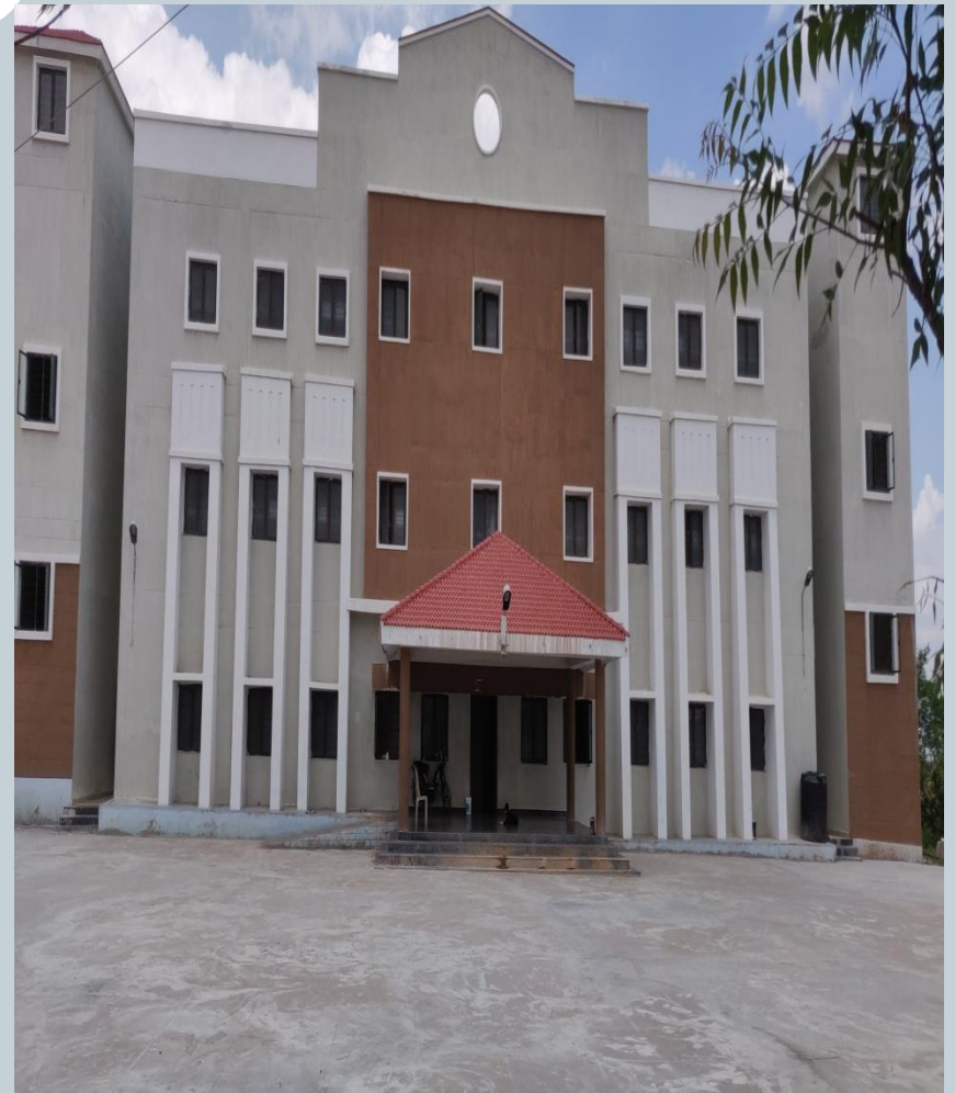
Mahila Gurukul Hostel